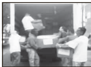
As a community service residents load supplies for Katrina hurricane relief.

We thank each and every one of you who has enriched our program by your contributions, whether in kind, with services, or with a check or support of our fundraisers. Without your continued support the Beacon House mission would not be able to continue its impressive success. I look forward to our continuing relationship and to the continuing transformation in the lives of the men at Beacon House. Thank you.